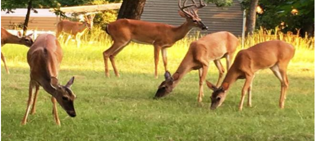
Morris continues to feed the deer in Harbor Point. He appreciates your help and the donations

<u>Please keep the cash, cans & corn</u> <u>coming</u>