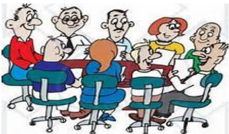
NFNCC thanks you for your support

Come join us on September 13, 2016 Meeting. at 6pm Dues are pro-rated beginning in June ($10 if you want a t-shirt).