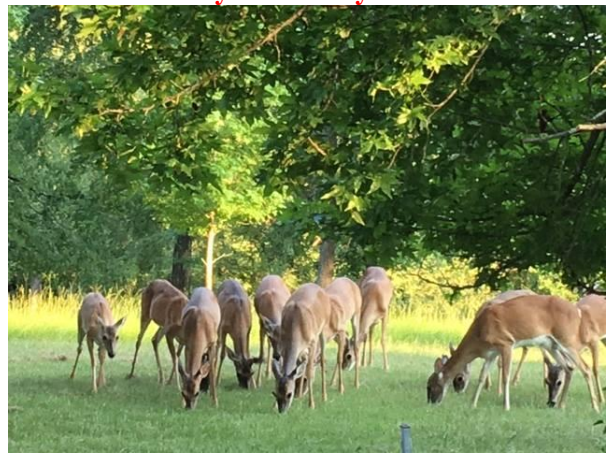
Morris appreciates your help and the donations Please keep the cash, cans & corn coming