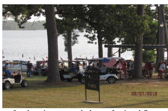
A perfect location to watch the professional fireworks across the lake.