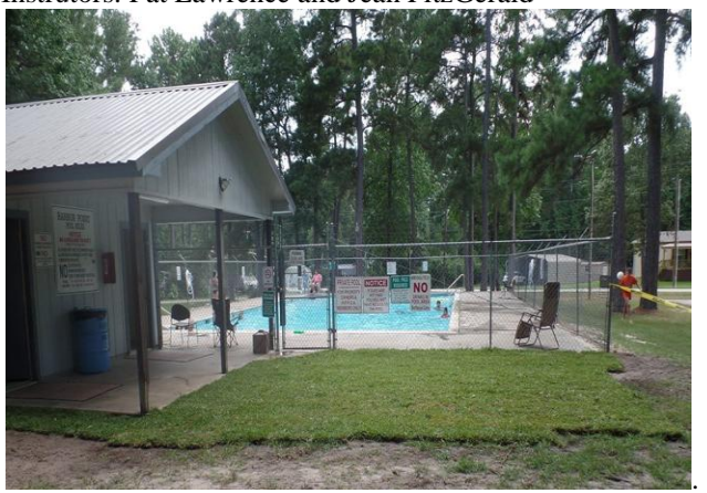
NFNCC purchased a pallet of grass which Randy and Pam Barrett installed at the pool entry. Keep your fingers crossed for rain!!!!!!