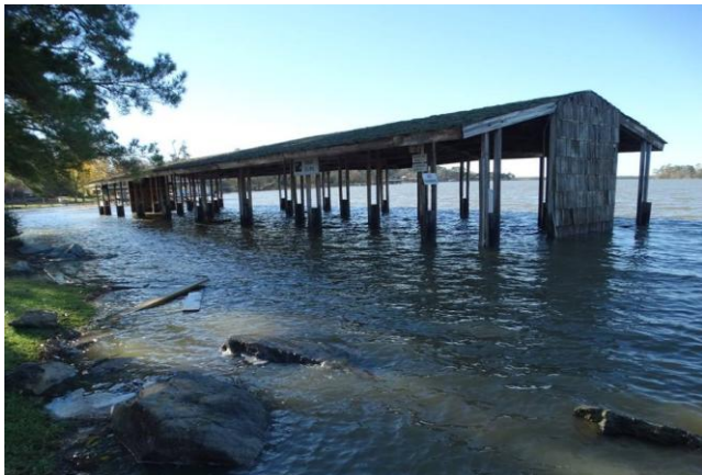
Look who is back in Harbor Point