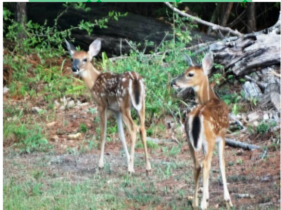
Thanks for the Donations