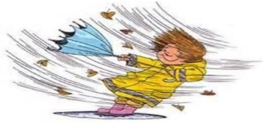
After the Storm