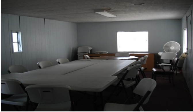
One last look

WE HAVE GREAT NEWS NFNCC GOAL OF RENOVATING THE CLUBHOUSE ***HAS STARTED***