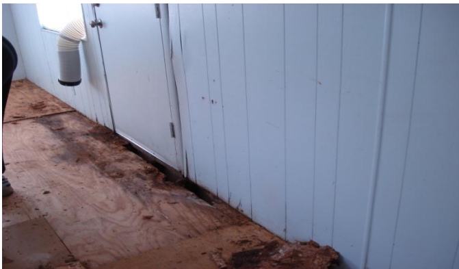
It's a wonder someone didn't fall through