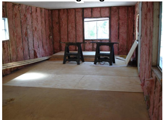
Plywood on the floor