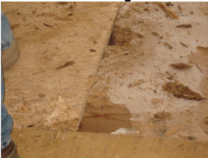
holes in the floor