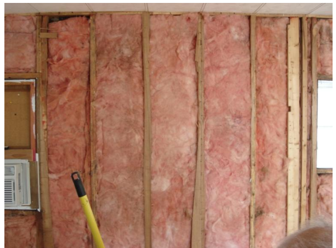
Paneling all gone