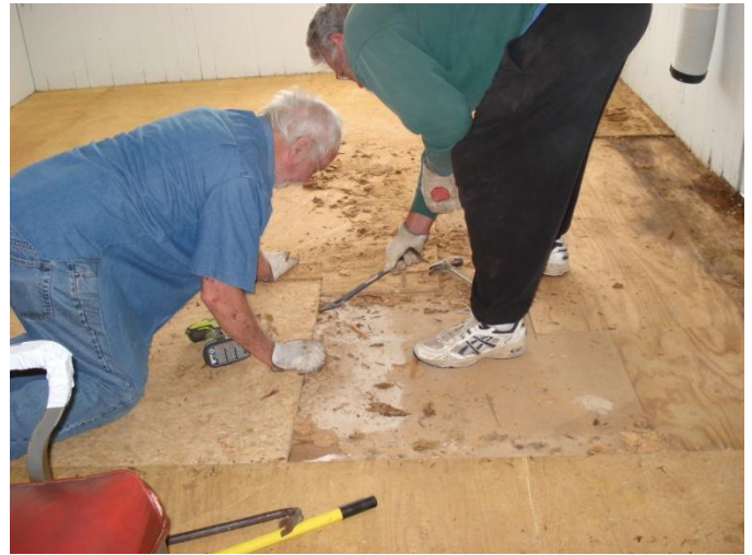
The NFNCC Contractors/Construction Crew