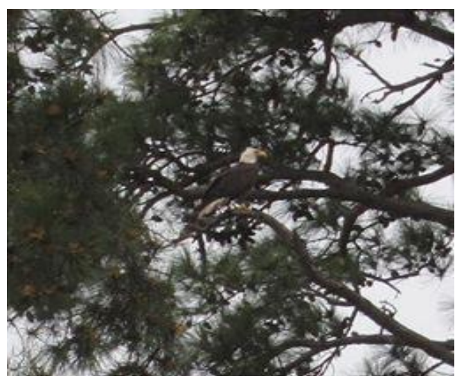
Keith Brown took this <u>amazing</u> picture in the park by the boat dock!

NOTE: Once again <u>Alice</u> came through for us and is giving us a fishing report!!!