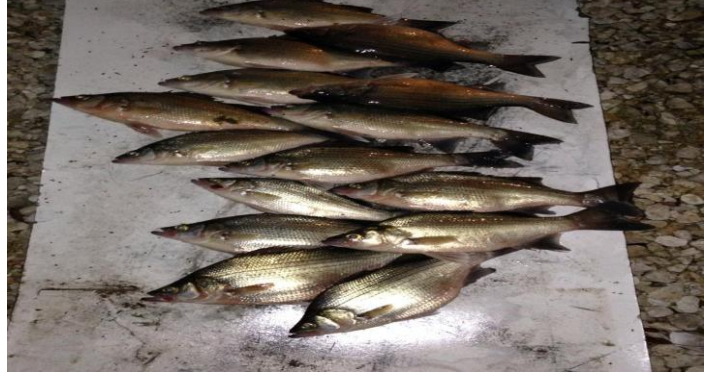
Fallon caught a nice size crappie while trolling and insisted Tammy cook it that night. They were using crank bait with a lip to get down in the water.

03-08-14 Rick & Tammy Yawn , and their Granddaughter Fallon Davis went from the public boat ramp on FM 19 or you can put in at harbor point, go through the jungle into the river. They were trolling for white bass up the river near the 190 bridge. They came home with 49. They used crank bait and limited out on Saturday. The white bass are in the river. It takes about 25 minutes to get there.