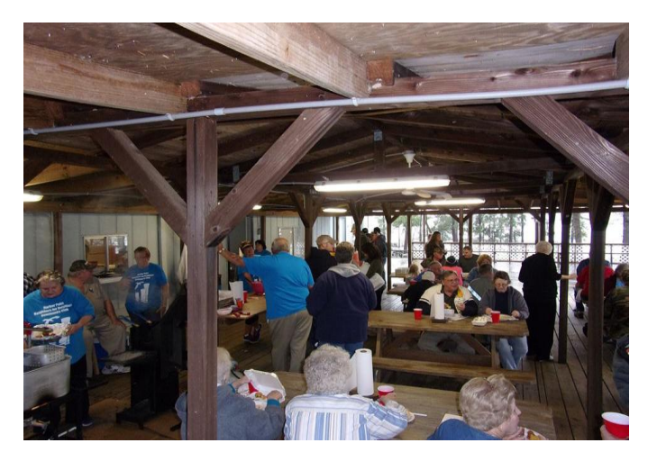
Thanks to all who helped and all who supported us

MAY 3 SAME DAY AS HPPOA MEETING PLATE $7.00 DESERT $1.00 5:00 pm AT CLUBHOUSE (WILL HAVE ANOTHER BURNER SO NO WAITING)