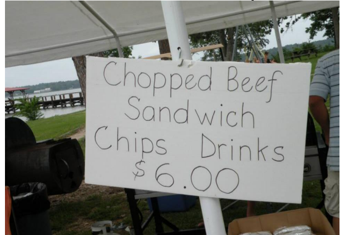
Helped with setups

NFNCC served at the Octoberfest. We made & sold desserts. We worked the golf cart poker run. We auctioned off a handmade quilt