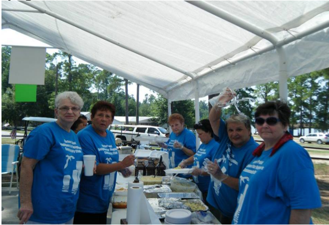
Served the dinners

We had a Cajun fest, a chopped beef sandwich, a pulled pork dinner, a gumbo dinner, & a spaghetti dinner