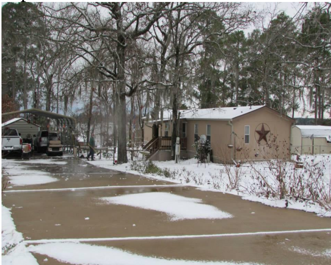
Alice & Pop Lankford