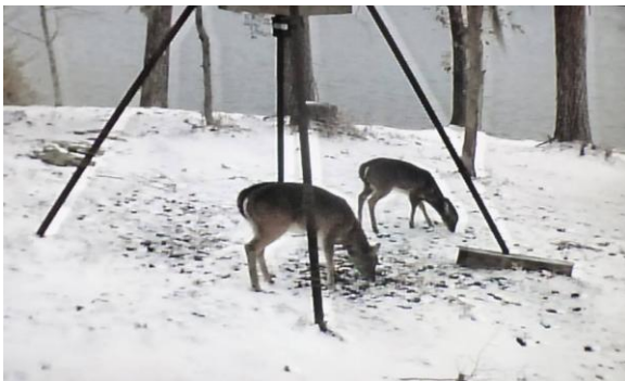
Kay & Bil Culpepper